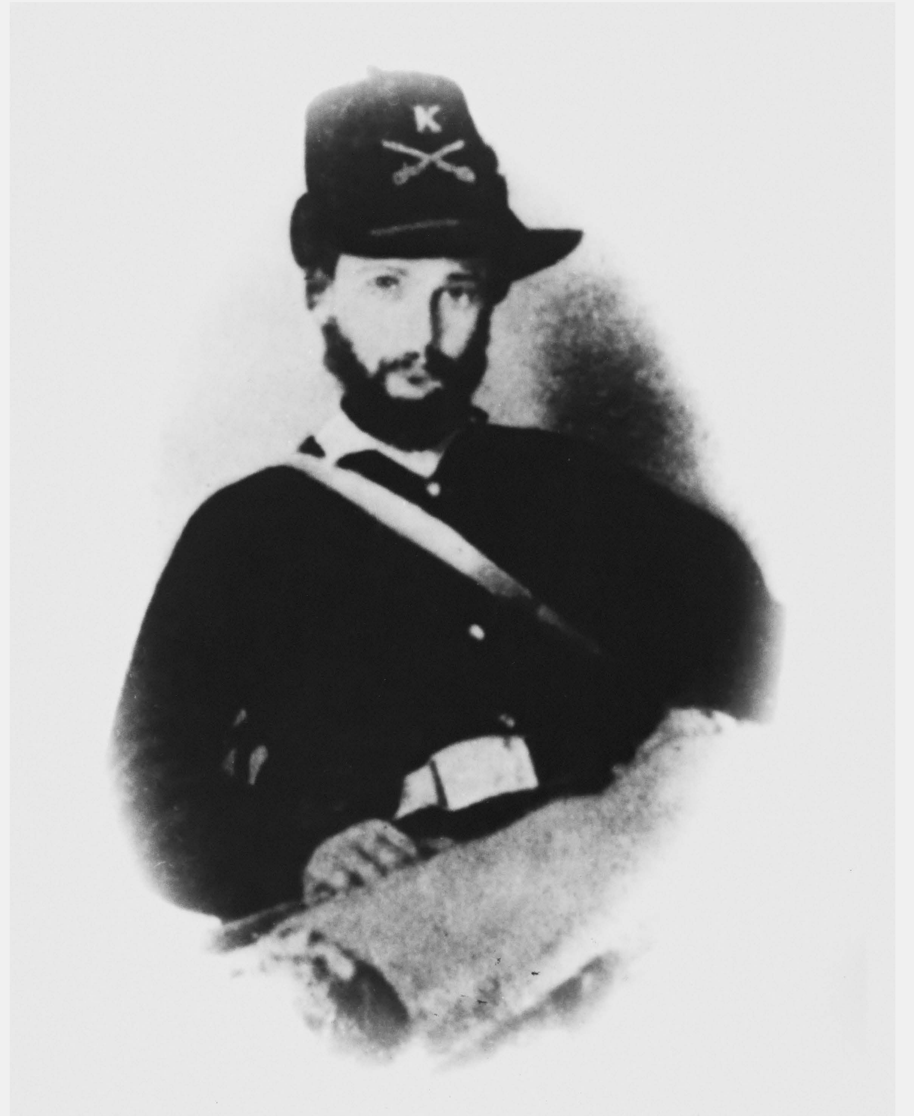
© National Museum of American Jewish Military History