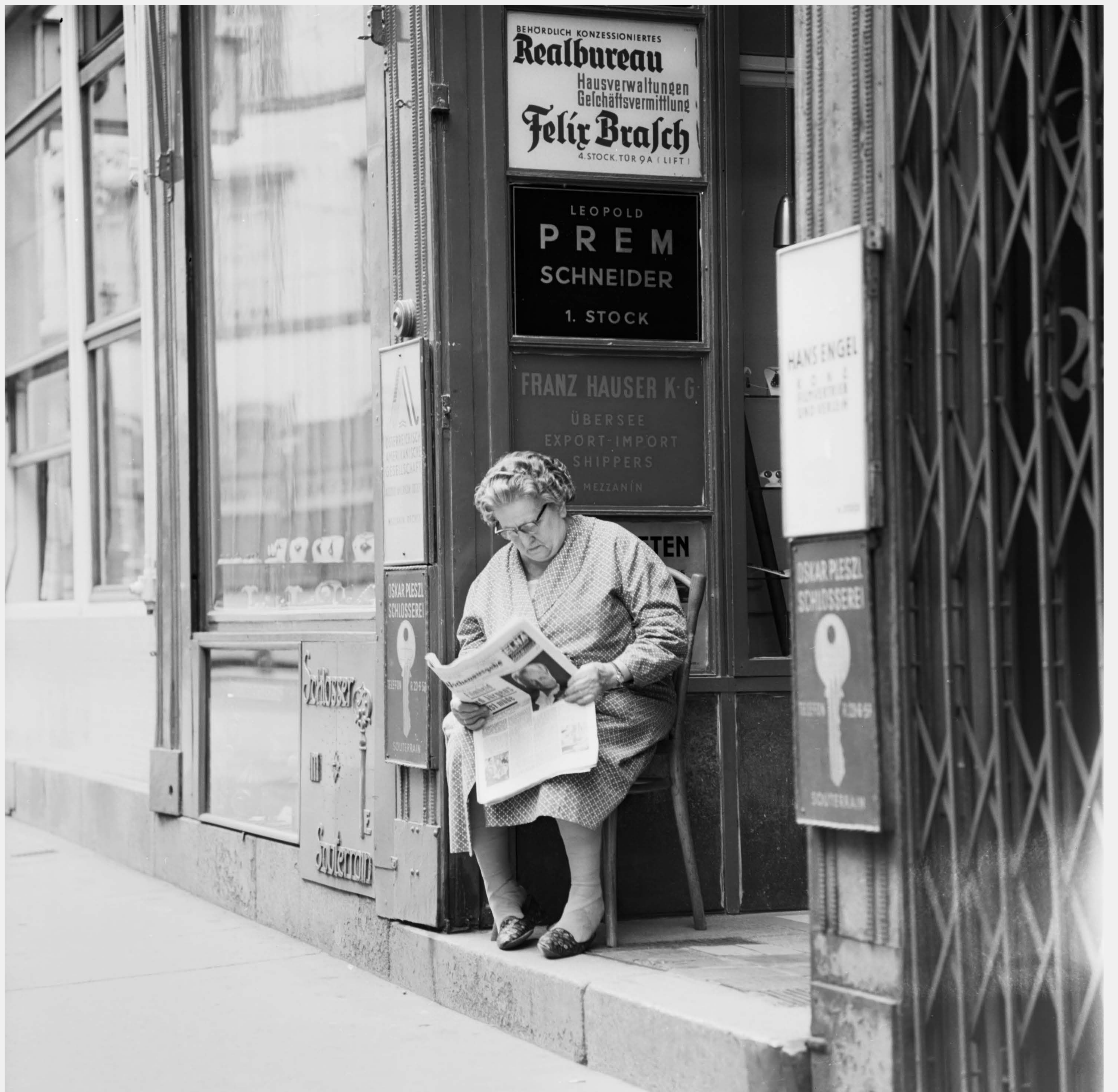
Photograph: Harry Weber, dated 1960. © Austrian National Library, Vienna, Image Archive (inventory number HW1960_1152_4_2_12)